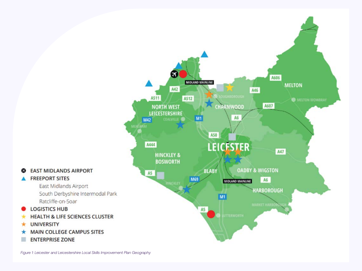
Figure 1 highlights the geographic, infrastructure and economic features relevant to the LSIP.

This connectivity supports a relatively cohesive geography regarding travel to work (TTW) and travel to learn, with four of the 10 largest TTW volumes across the whole of the East Midlands being contained within Leicestershire (Charnwood to Leicester; Blaby to Leicester; Leicester to Blaby; and Oadby & Wigston to Leicester). Furthermore, there is little leakage out of area – the main outbound flow being Leicester to Nottingham, which ranks 17th out of all movements within city and county.