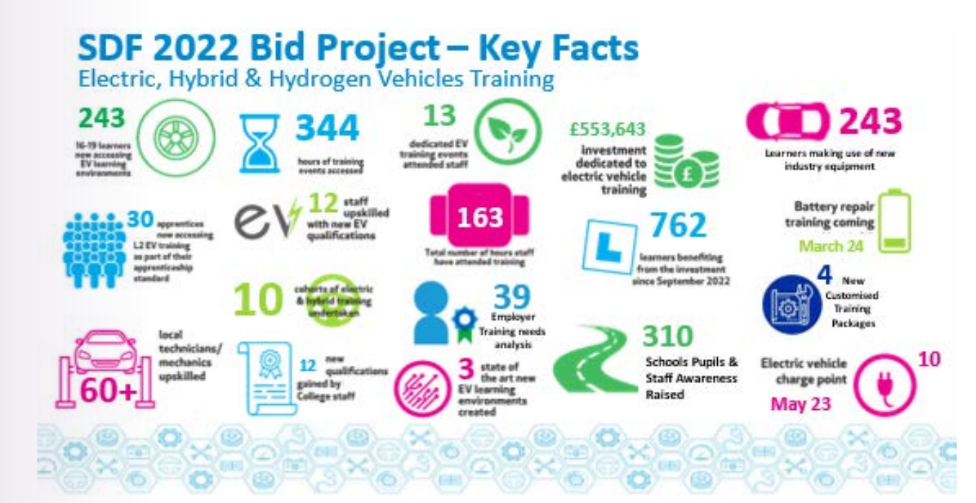
Figure 4: SDF 2022 Impact Data